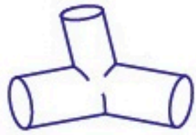
(A2) 1 pcs