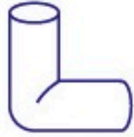
(G) 2 pcs