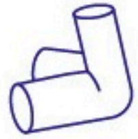
(A1) 1 pcs