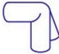
(B1) 1 pcs